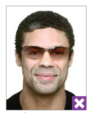
Eyes must not be obscured