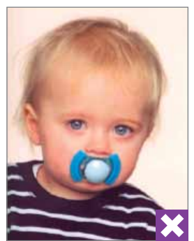
The face must not be obscured