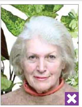
The background is not light grey or cream