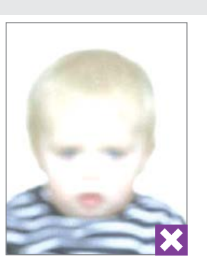
Too blurred to capture facial detail