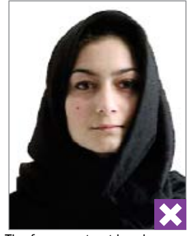
The face must not be obscured by shadow or head covering

If photos don't meet with our standards, we will ask you for another set and this will delay your application.