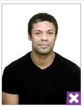
Too far away