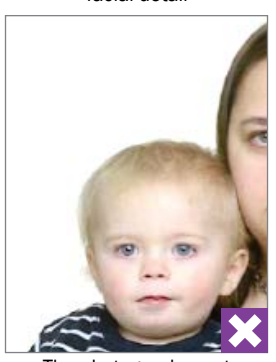
The photograph must feature one person