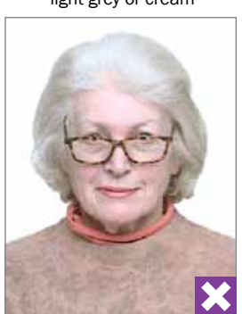
Glasses must not cover the eyes